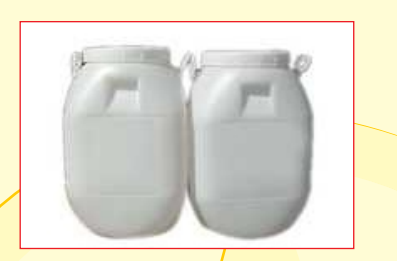
Trichloroisocunaric Acid (TCCA)