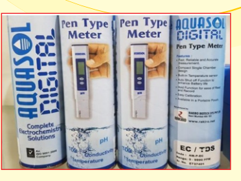
Water Analysis Test Kit