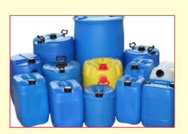
Boiler Water Chemicals