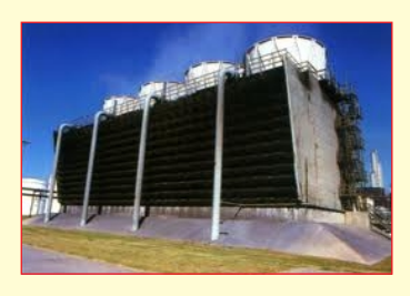
Cooling Water Chemicals